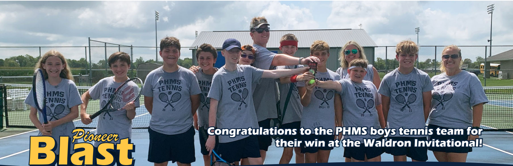
Congratulations to the PHMS boys tennis team for their win at the Waldron Invitational!